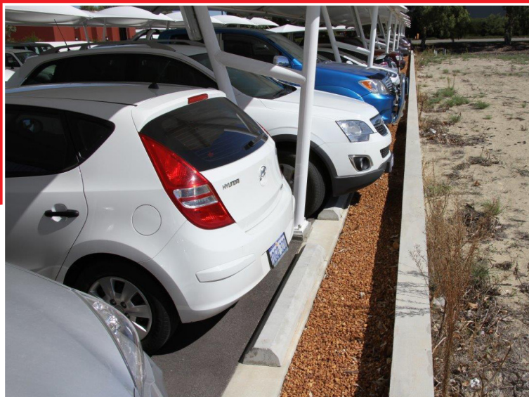
Image Bollards Concrete Wheel Stop