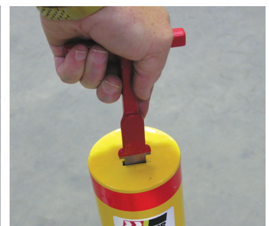
Tee-lok model (SMTL).