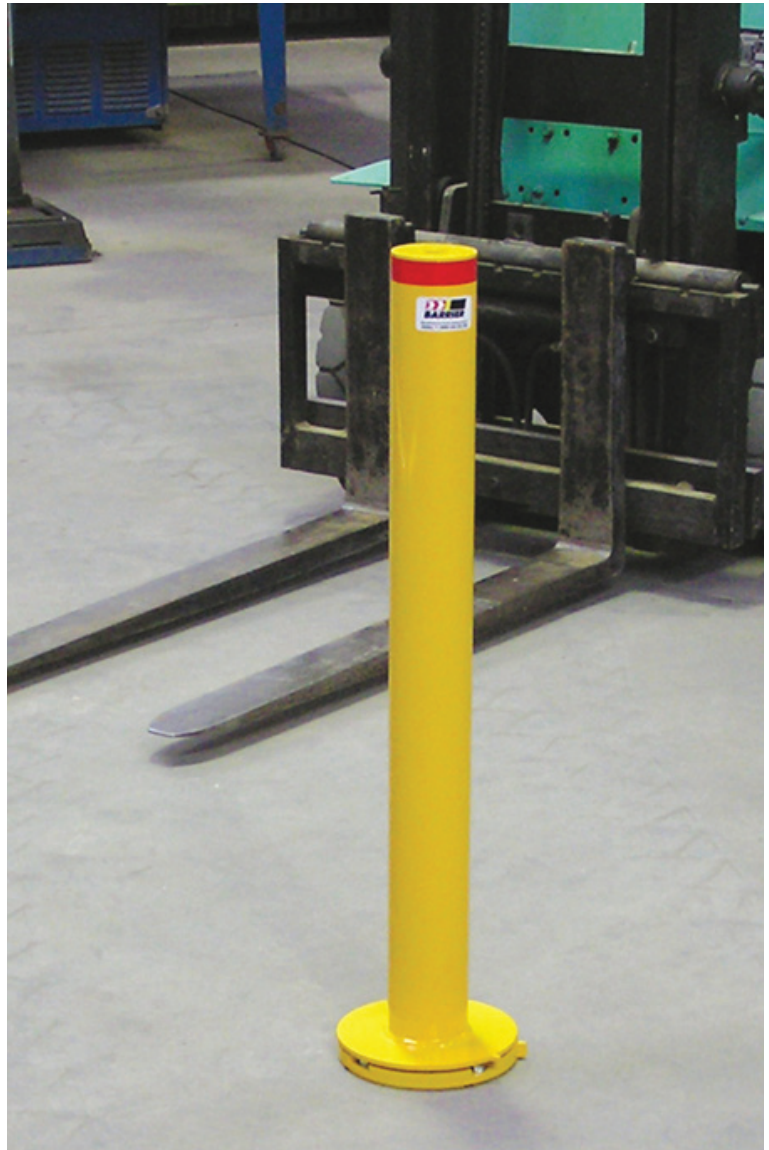
Tee-lok model shown.