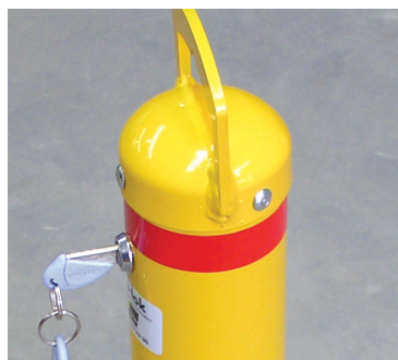
Cam-lok model (SMCL).